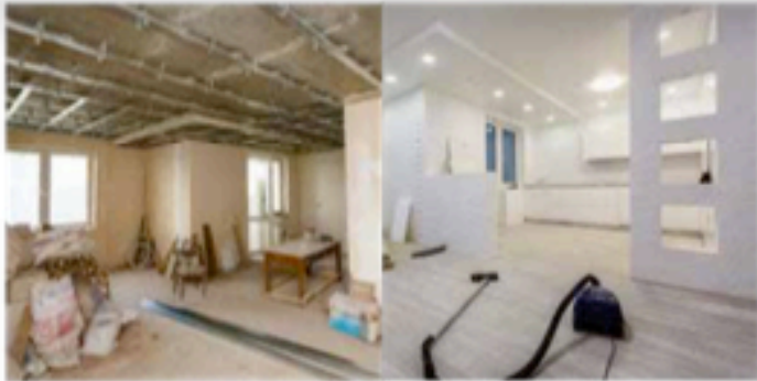
Before | After