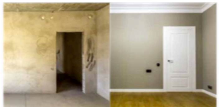
Before | After