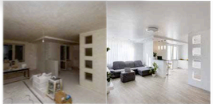
Before | After