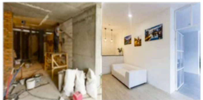
Before | After