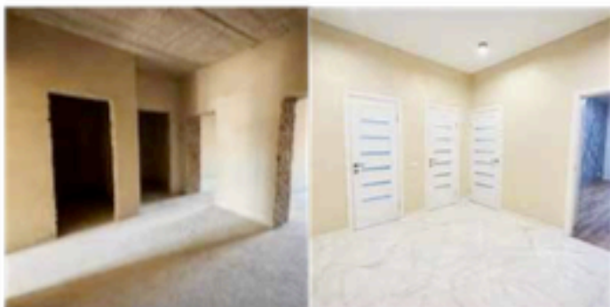
Before | After